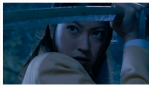
Negative Happy Chainsaw Edge Mango Premiere