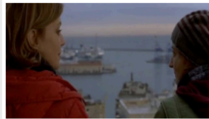
Days and Clouds Mango Premiere