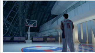
Kung-Fu Dunk Mango Premiere