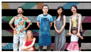
Hospitalité Mango Premiere