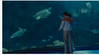
Ocean Heaven Mango Premiere