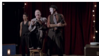
Around a Small Mountain Mango Premiere