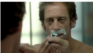
La Moustache Mango Premiere