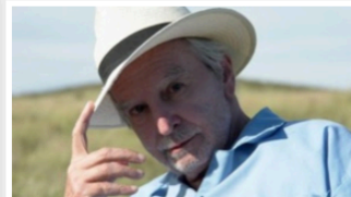
The Window Mango Premiere