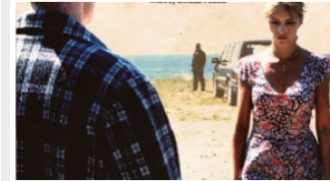
Jerichow Mango Premiere