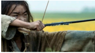
Little Big Soldier Mango Premiere