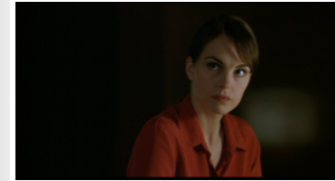
Yella Mango Premiere