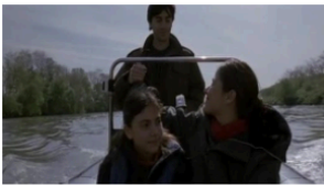
Light of my Eyes Mango Premiere