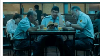
Gigante Mango Premiere